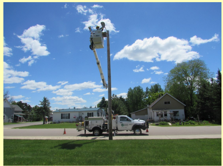
Lineman John Bestul replaces the old lights with new, more efficient, LED lights

Central Wisconsin Electric Cooperative continues their commitment to community by changing out street lights in Tigerton Wisconsin. CWEC are replacing the 150 Watt high pressure salt bulbs with energy efficient 82 Watt LED bulbs. The two part project started with replacing 100 street lights. The lights are Department of Transportation approved, which means that the bulbs are designed to be used as streetlights, and cause less glare to drivers on the road. The second part of the project will be replacing 64 lights in the Stockbridge-Munsee housing. This project will help save the town and tax payers money on electricity.